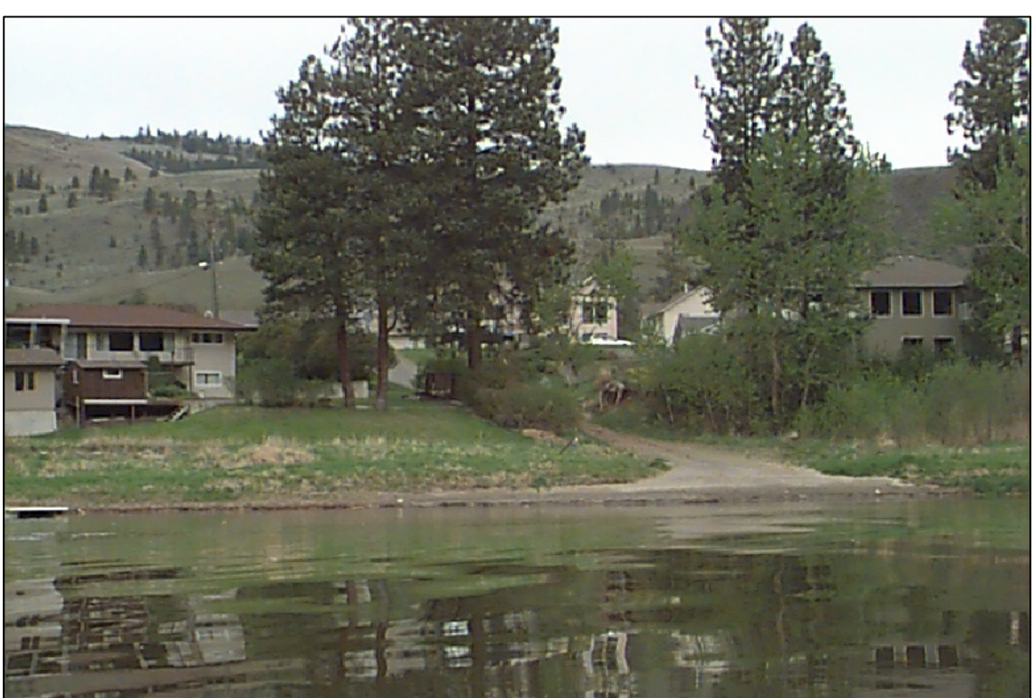
RIGHT BANK VIEW