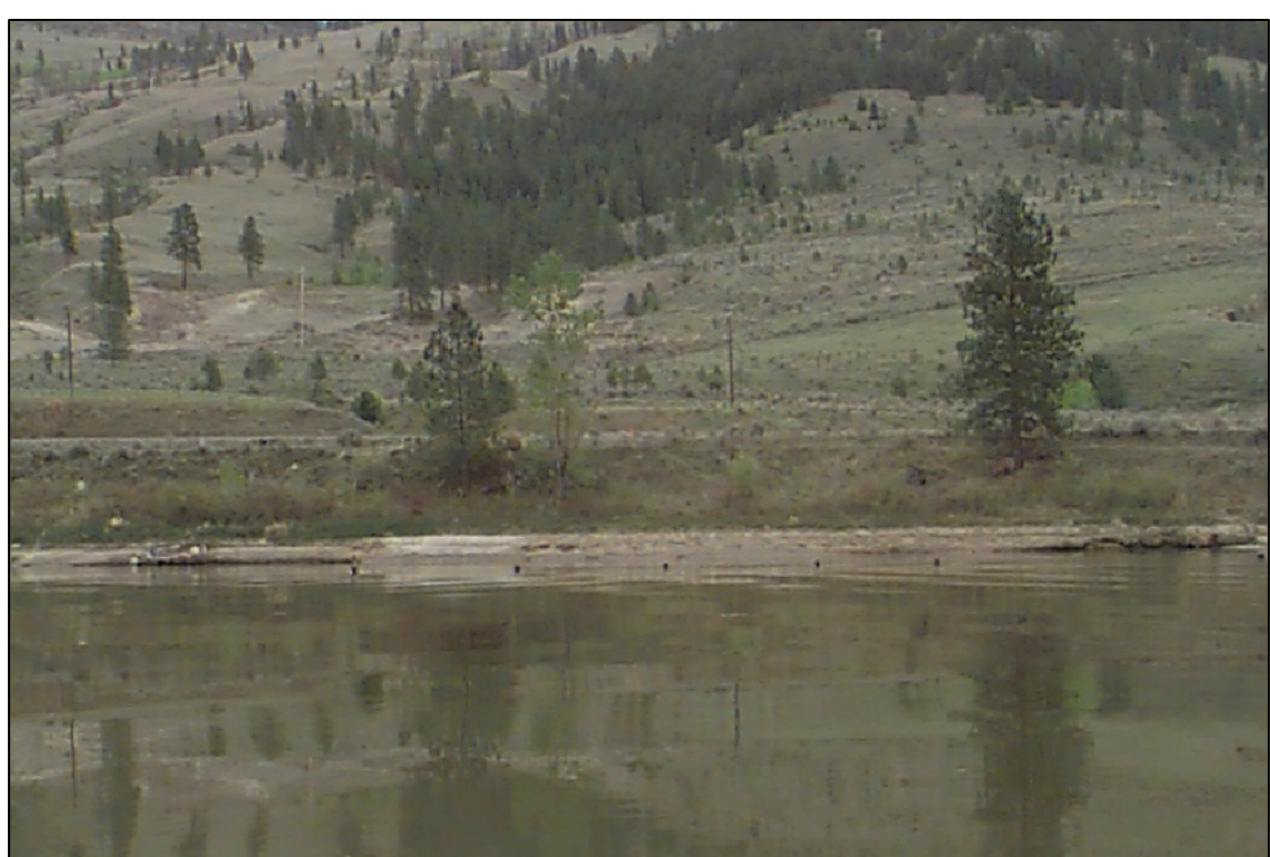
LEFT BANK VIEW